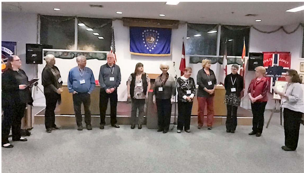
DBIA Eugene, OR Lodge 348 Officers are installed.

Total Chapter Charitable Contributions & Scholarships $96,641