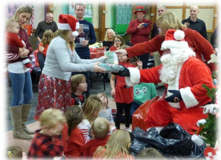
Members of DBIA Lodge 35 in Chicago, IL enjoy the Lodge Christmas Party, complete with Santa Claus.