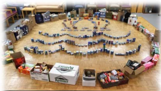
Royal Copenhagen was founded in 1775 The 3 waves represent the 3 seas surrounding Denmark - the North Sea, the Kattegat, and the Skagerrak. Pictured is the logo on back of every piece of china.

Assured Life sponsored the Strikes Against Hunger National Bowling Tournament benefiting Feeding America as part of its national food drive. Of the total $3,410 donated to local food banks and programs, the tournament accounted for $540 donated to Feeding America; representing 7,560 lbs of grocery product, or 5,940 meals.