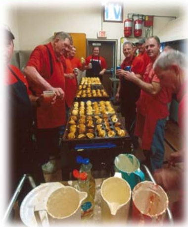
DBIA Lodge 34 in Dwight, IL puts on its annual Aebleskiver Breakfast.