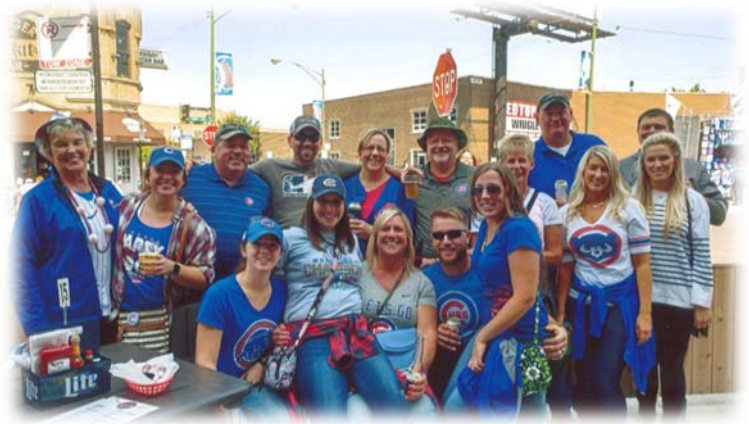
Members of DBIA Lodge 34 in Dwight, IL enjoy a social outing to a Chicago Cubs baseball game.