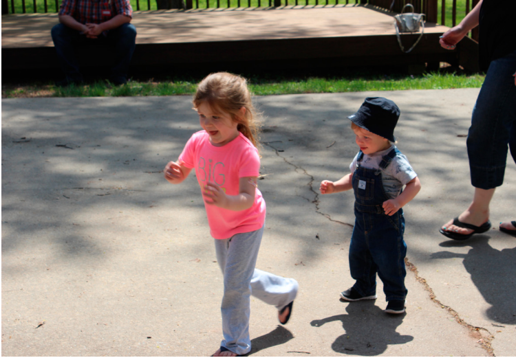
Who says our members are old?!

The General Committee of Eastern Lodges District of the Danish Brotherhood was held on April 22-24, 2016 at the Danish Home in Edison, NJ. What was once a Danish old people's home is now the Danish Archive of the North East (DANE). Again, the meeting was well attended and full of activities.