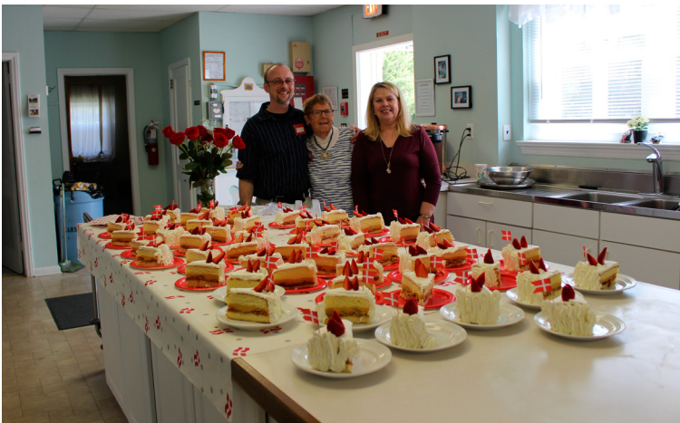
Danish District conventions always include food and an adult beverage or two – and of course dessert.