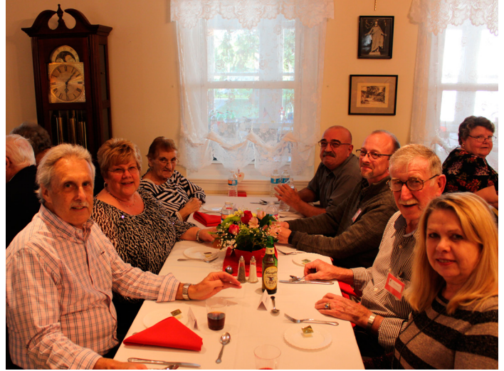
GCEL Members await the banquet meal.