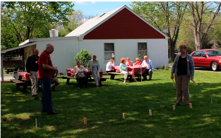
GCEL Members enjoy the nice weather with some outdoor activities.