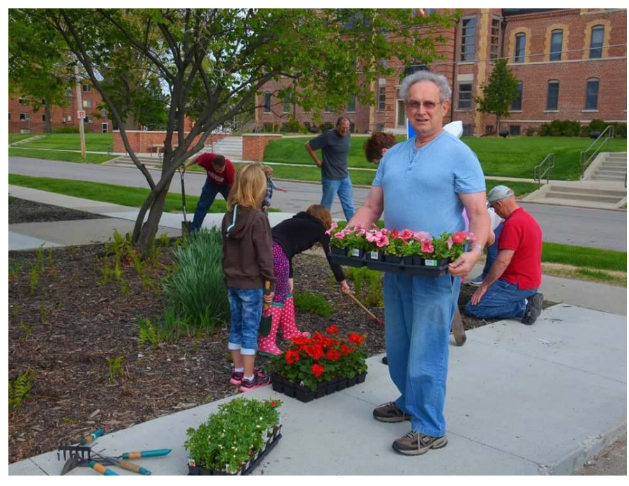
Members and kids of Danish Brotherhood Lodge 15 in Des Moines, Iowa help to beautify the grounds of a local church.