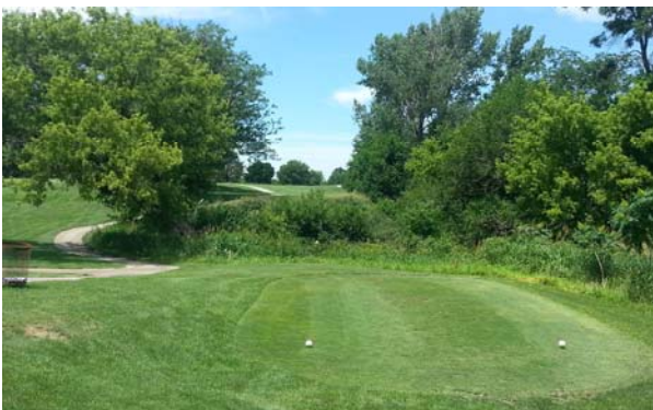
River Wilds Golf Club—Blair, NE