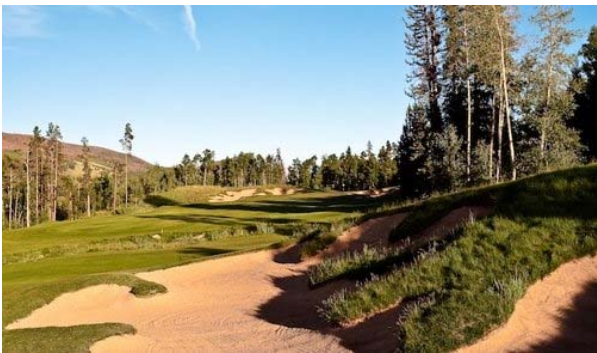
Raven Golf Club at Three Peaks—Silverthorne, Colorado