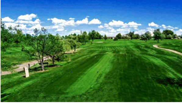
Eaton Country Club—Eaton, Colorado