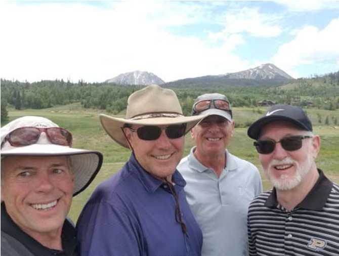
The Happy Hour Hackers get ready for their tournament round.