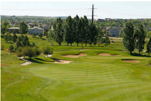
Highlands Ranch Golf Club—Highlands Ranch, CO