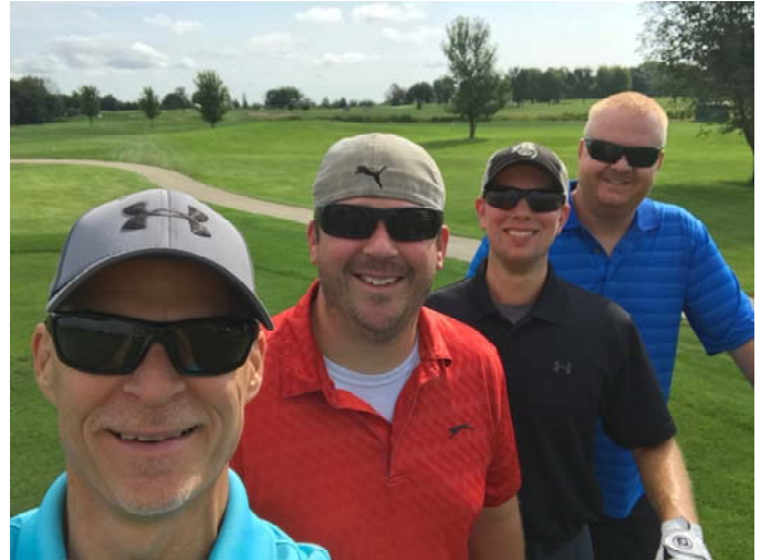
The Huskerteers get ready for their tournament round.