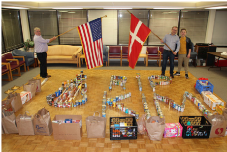
Honoring the death of Danish singer, Kim Larsen, DBIA Lodge 29 in Seattle, WA created a memorial with their food build.

of food valued at approximately $1,500 plus over $400 in cash donations to Hopelink, serving homeless and low-income families, children, seniors and peo-