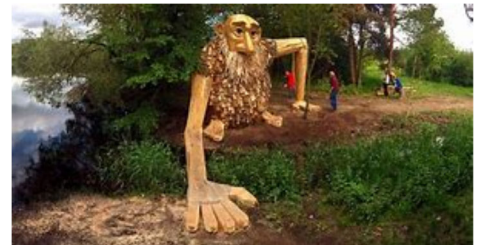
Here you get a sample of Thomas Dambo's work.