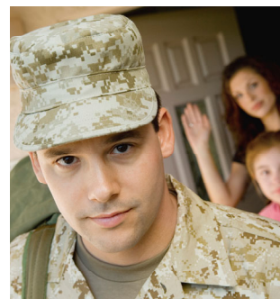
Help the National Military Family Association's Operation Purple summer camp program!